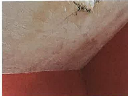
1114-2 Drywall/Joint Compound Typical Interior Walls/Ceilings