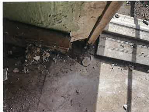
1114-4 12"x12" Floor Tile/Adhesive Interior Laundry Room