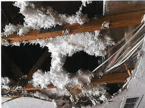
1114-1 Insulation Typical Interior