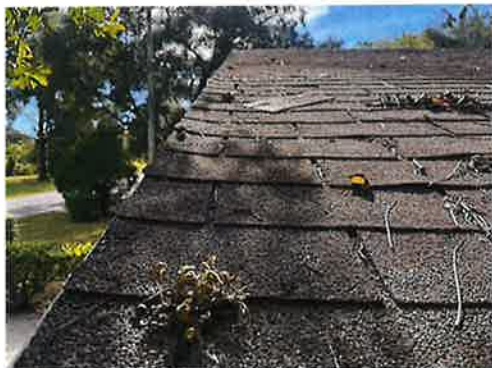
1114-5 Asphalt Shingle/Tar Typical Exterior Roof