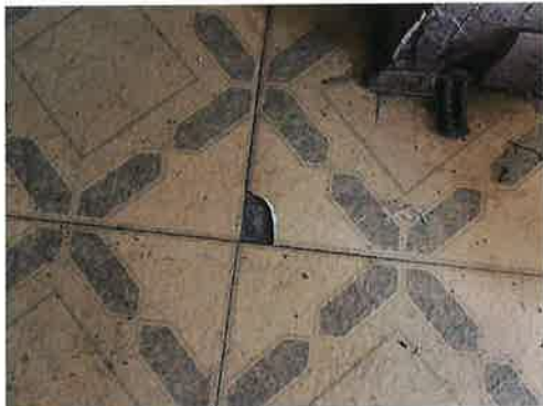
1114-3 12"x12" Floor Tile/Adhesive Interior Bedrooms